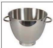
7L STAINLESS STEEL BOWL